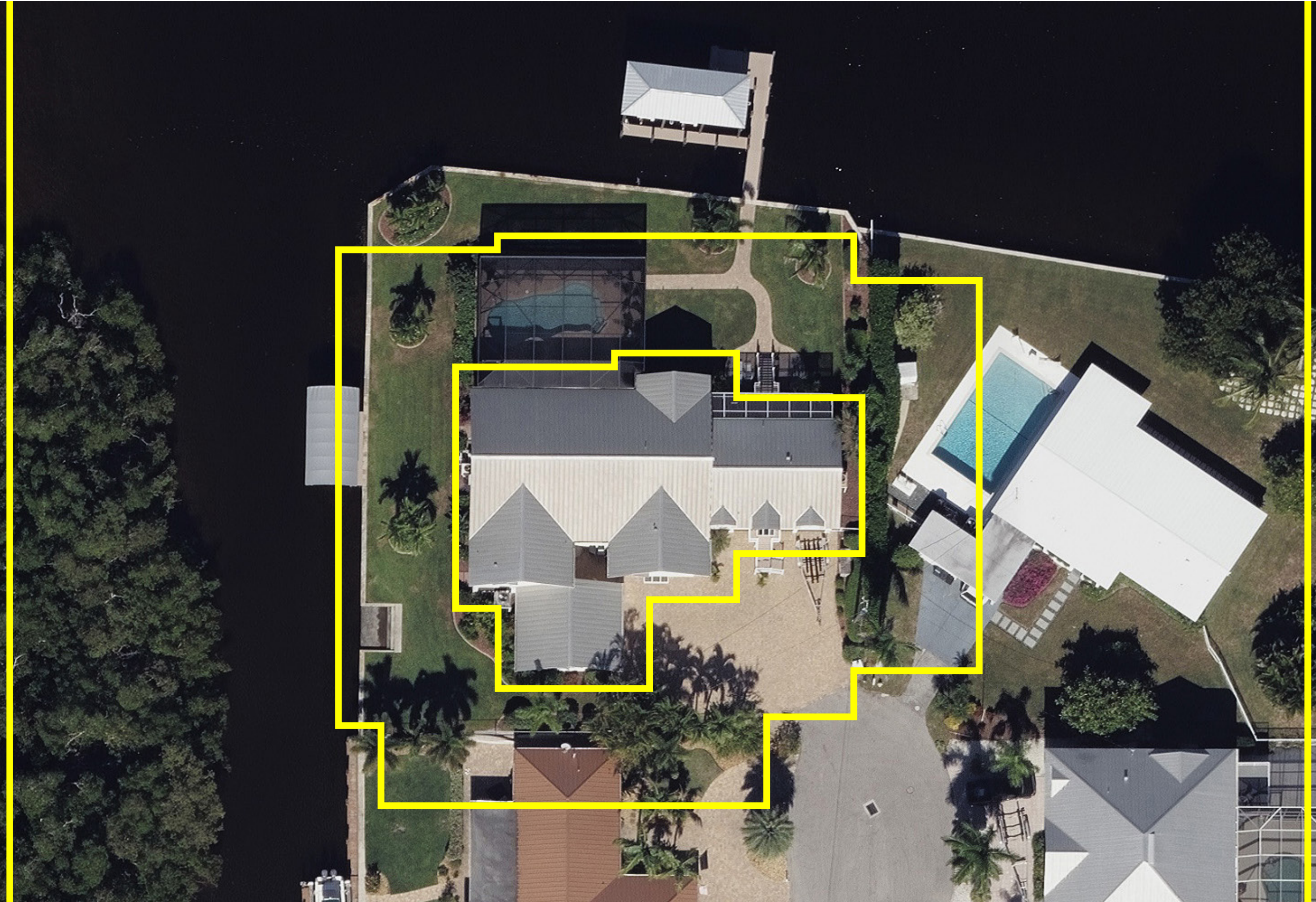
Analysis based on 16 November 2021 imagery