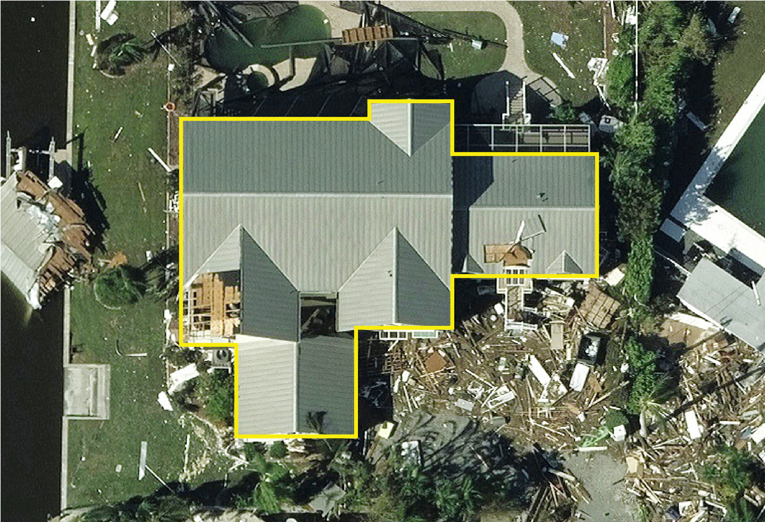
Analysis based on 29 September 2022 imagery