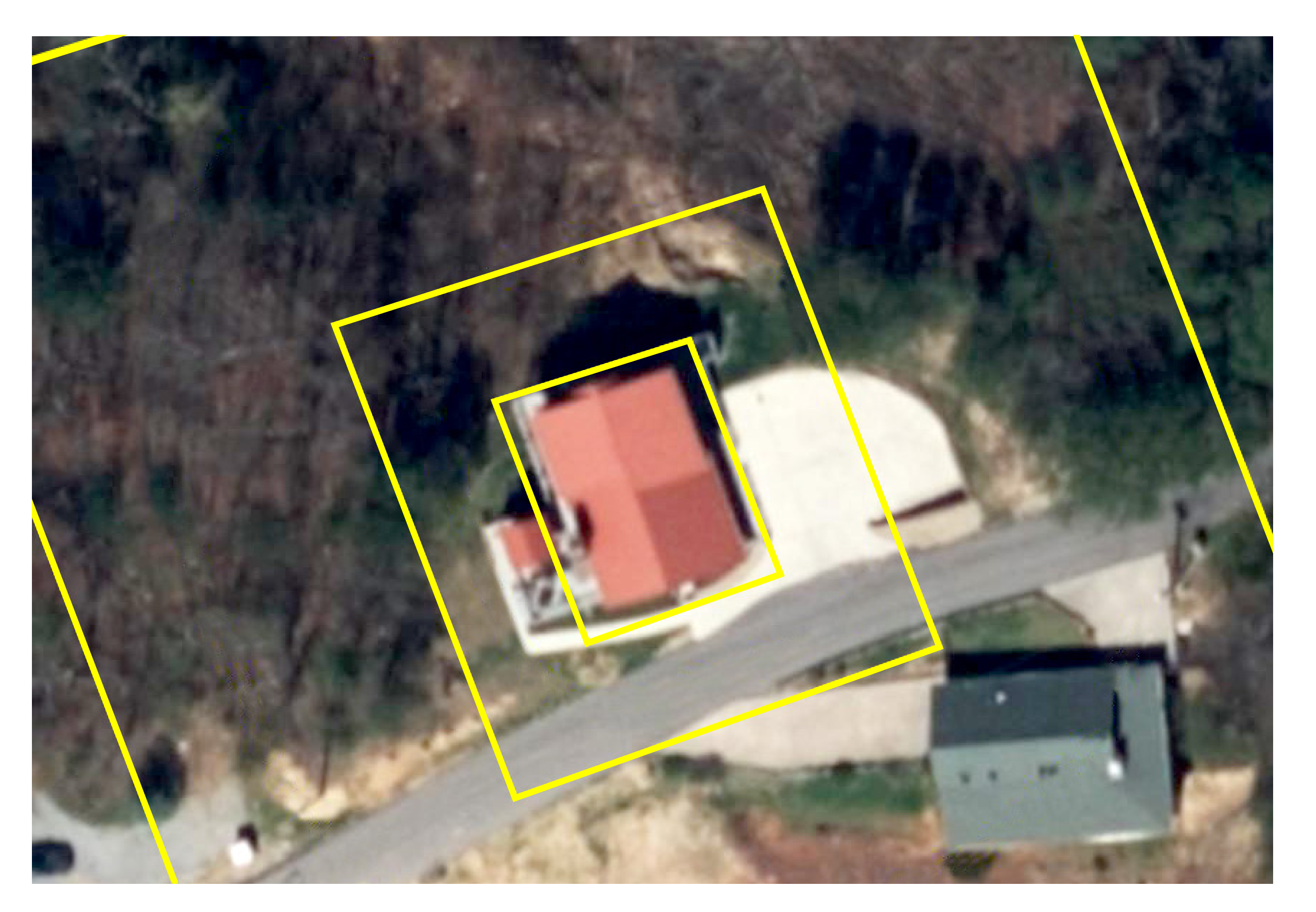
Analysis based on 03 April 2021 imagery